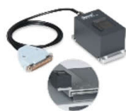
9036 Tip Calibration Device